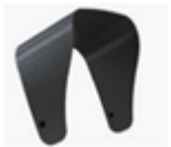
Outer light shield