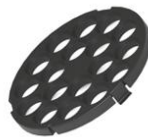
Outer light shield Honeycomb anti-glare net Deep cylinder anti-glare shield